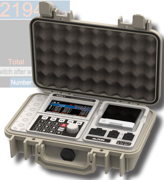
ARW-1F [ ZIGBEE WIRELESS ]