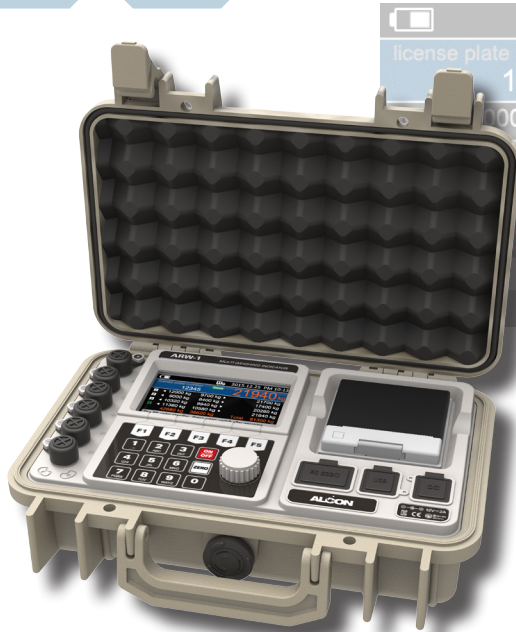
ARW-1 [ WIRE TYPE ]